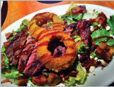
The new bar menu features about 30 items -- appetizers, sandwiches, burgers, pizzas and salads. Shown: Steak salad, topped with Angus sirloin. Cost: $10.99. Other salads on the menu: Chicken Cobb and Wedge.