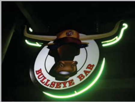
A neon Bullseye Bar marquee sign is hard not to miss at the entrance of the bar. The bar's slogan: "Hi-Def Food, Drinks and Sports!"