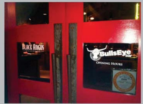
In Orange County, Black Angus restaurants in Santa Ana and Buena Park have added "Bullseye Bars" to their interiors. The Santa Ana Black Angus is at 1350 N. Tustin Ave. The Buena Park restaurant: 7111 Beach Blvd. Of the 46 Black Angus restaurants, 15 have Bullseye Bars, according to the chain's Website.