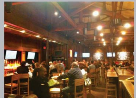
The large bar area is peppered with giant flatscreen TVs and historical news photos of local sports teams, including the Anaheim Angels and Los Angeles Dodgers. Free Wi-Fi is available throughout the lounge.