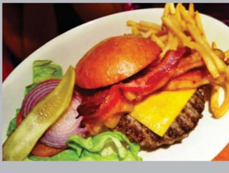
The new menu includes a section called Linebacker Burgers, which features a Steakhouse Bacon Cheeseburger (shown), a Mushroom & Bleu Burger and a Shaved Prime Rib Burger. Each burger is served with french fries and onion rings, or coleslaw, according to the menu. However, our plate came with only fries!