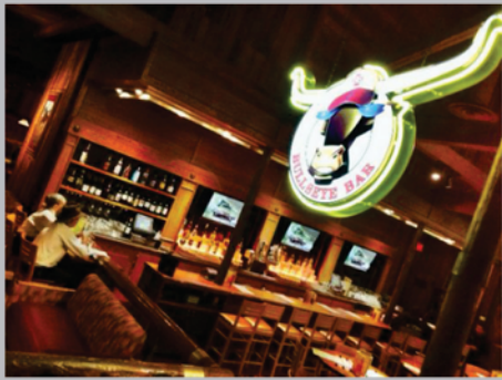
The Bullseye Bars feature high-definition TVs for sports enthusiasts, including three behind the bar at this Black Angus in Santa Ana. The revamped bar area celebrates its grand opening Thursday night.

By NANCY LUNA THE ORANGE COUNTY REGISTER