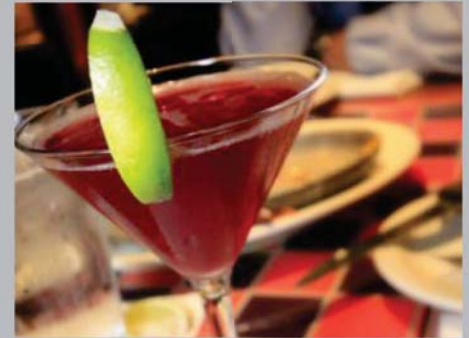
Like the old Black Angus bar, the Bullseye Bar offers Happy Hour specials: $3, $4, $5 drinks, and appetizers Monday through Friday from 4 p.m. to 7 p.m.