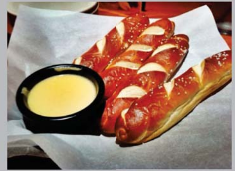
The expanded Bullseye Bar menu features 11 starter items, including Soft Pretzel Sticks. The appetizer dish is served with cheese sauce. Cost: $4.99. So far, the chain has opened 16 Bullseye Bars, including two in Orange County.