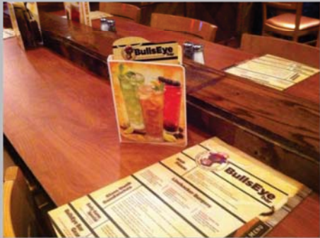
The Bullseye Bar menu boasts several sporty subsections such as Linebacker Burgers, MVP Pizzas, Slam Dunk Sandwiches and an Early Game Special (a breakfast burrito served on Saturdays and Sundays).