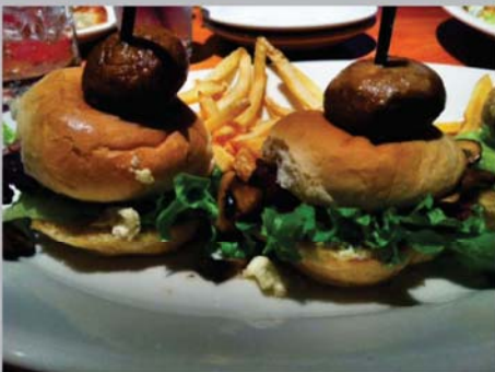
Sliders are new items on the Bullseye Bar menu: Filet Mignon Sliders (shown) and Blackened Chicken Sliders. Cost: $7.99-$8.99 (comes with shoestring fries)